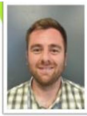
Designated Safeguarding Lead (DSL)